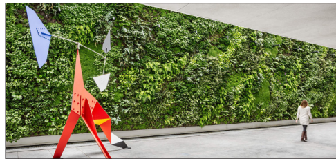
"Living Wall" at SFMOMA

He shared the design process of assessing a space for its functionality and purpose, to considering suitable plant palettes and how the installation would be maintained. Addressing these factors establishes parameters for increased success in any landscape design regardless of the location. From there, aesthetic decisions regarding color, texture, shape, size and how the design will blend with its surroundings can be considered much the same as in traditional landscapes. Brenner's expertise with growing mediums and plant species interaction have led to his work with clients ranging from the San Francisco Museum of Modern Art and the Hammer Museum in L.A., to Facebook Cafe, Del Amo Fashion Center, Cal Poly Vista Grande, and residences in both northern and southern California.