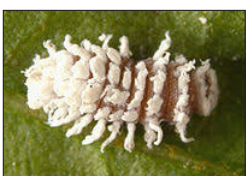
Larva of the Mealybug Destroyer: Cryptolaemus montrouzieri