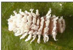
Larva of the Mealybug Destroyer: Cryptolaemus montrouzieri

As many of our gardens will be needing a fall clean-up soon, this informative presentation will be an asset in identifying bugs we may want to keep around. Please join us.