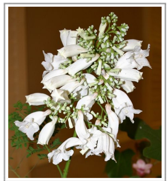
Jacaranda mimosifolia 'Alba'