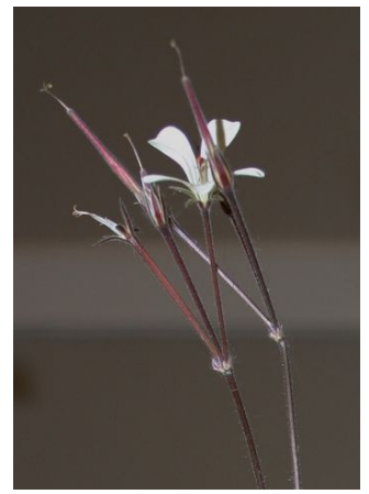
From left: Rhododendron cubittii 'Ashcombe'; Rhododendron ; Plieone fomosana ; Pelargonium sp..

Dendrobium kingianum , pin rock orchid (Orchidaceae), by Gloria Leinbach, Torrance. New South Wales and Queensland, Australia. This beautiful, small, lithophytic orchid comes from rocky cliffs but performs very well as an epiphyte in pots or on slabs in cultivation. Pseudobulbs grow to 6 inches tall with 4-6 leaves. 1-inch fragrant flowers, borne in winter, are lavender-mauve, shell pink, white and various combinations, with striped lips. Grow in low to medium light and cool to intermediate temperatures.