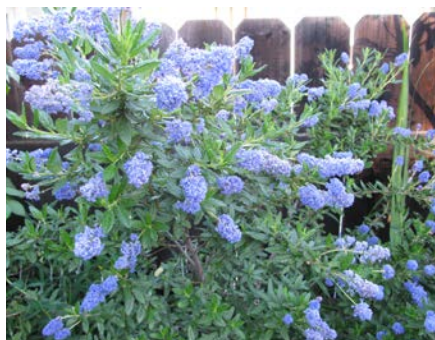
The Growing Natives

Symposiums have been sponsored by Pacific Horticulture and various other agencies, including East Bay Area Water District (EBMUD) and CNPS. The previous events were held in the Bay area, and in an effort to further the cause of educating the public about growing California native plants, this series is being extended to other regions.