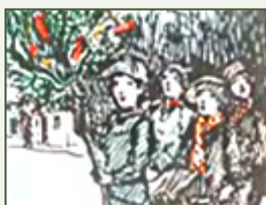
Lore and Legends of Christmas Greens