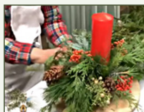
California Native Plant Arrangements